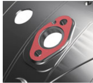
TS200: High speed finishing TS300: Scaling and roughing